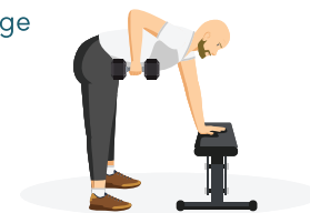
supported bent over dumbbell row