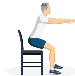
sit to stand