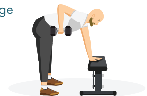
supported bent over dumbbell row